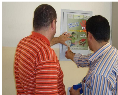
Non-Violence Group in Dohuk

The event was covered by local media, Kurdistan Satellite and Kurdsat Satellite.