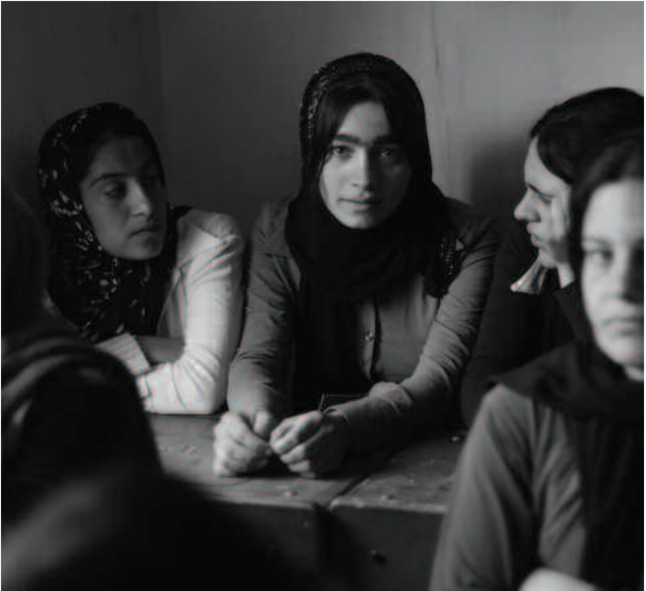
A young woman attends a seminar held by WADI.