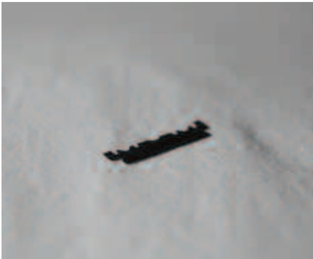
Girls are forcefully held down and their legs pried apart. The midwife cuts their clitoris with a razor blade, which often is unclean and unsterile.